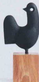
Cast-iron chicken from Nalata Nalata