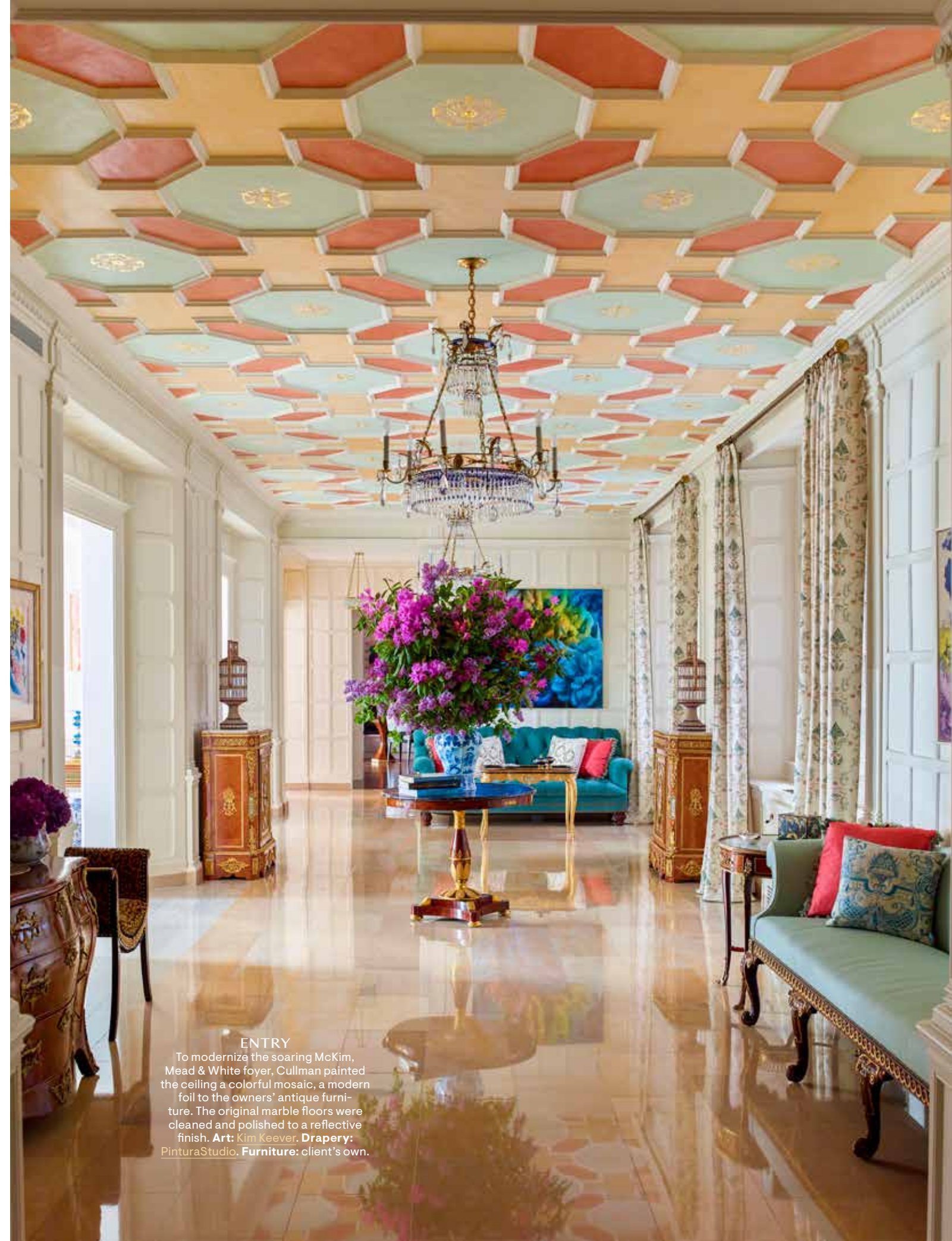
ENTRY To modernize the soaring McKim, Mead & White foyer, Cullman painted the ceiling a colorful mosaic, a modern foil to the owners' antique furniture. The original marble floors were cleaned and polished to a reflective finish. Art: Kim Keever. Drapery: PinturaStudio. Furniture: client's own.